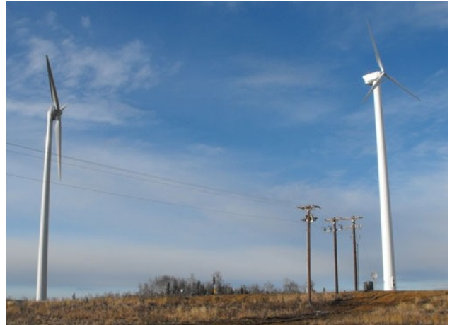
Information and photos courtesy Delta Wind Farm

was a EWT 900 kW turbine built with private capital and a matching State of Alaska grant through House Bill 151. The Delta Wind Farm has been used as a testing ground for both of these turbines. The arctic environment creates unique obstacles for wind turbines and by working with Northern Power and EWT these difficulties have largely been addressed. The Southwest Power and Northern Power turbines have since been installed at several locations around the state with the EWT turbine slated to be installed in Kotzebue. Sixteen more turbines are scheduled to be installed in the summer of 2012 expansion of our Delta Wind Farm.